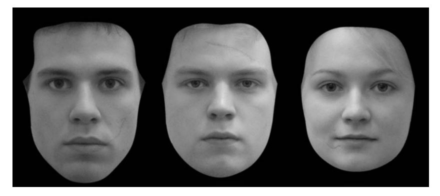
Fig. 1. Example stimuli. Three-face composites transformed +30% of the difference in color between original images of scarred patients and those same images with scars removed.

R.P. Burriss et al./Personality and Individual Differences xxx (2008) xxx-xxx